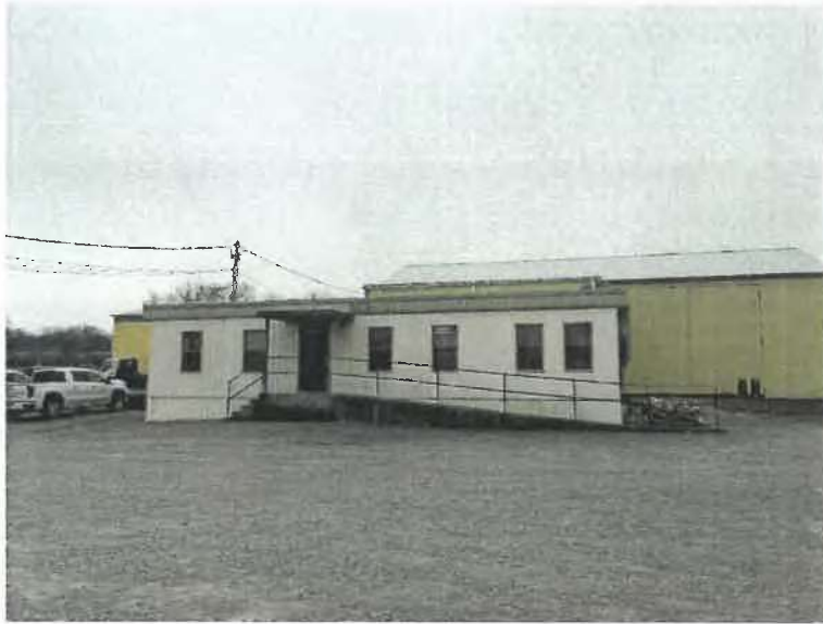
View of Buildings From Front