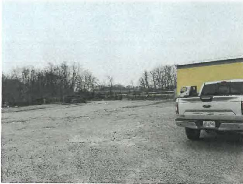
View Toward Railroad

The building and site are located in an area that will not be negatively affected whatsoever by the proposed use.