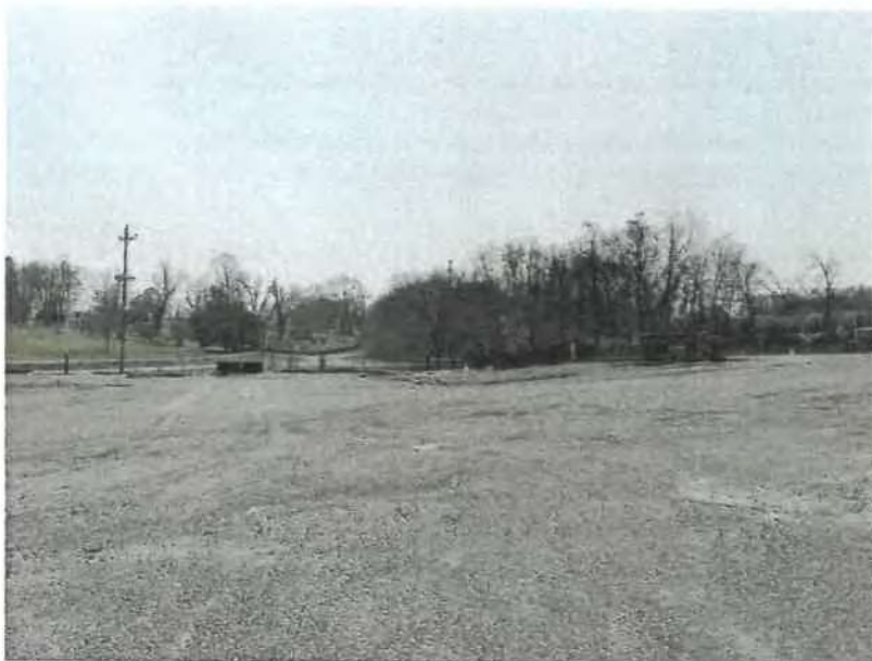
View Toward Cemetery