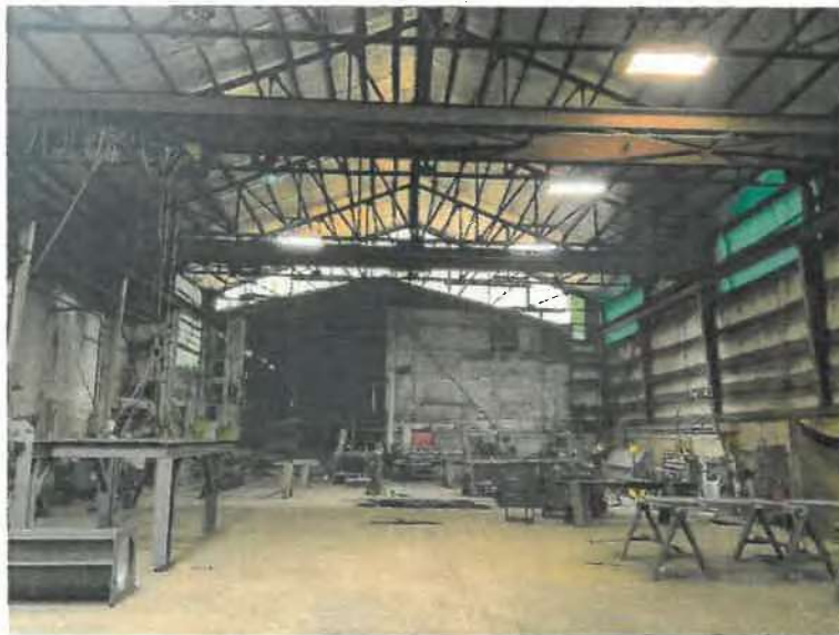
View of Plant Interior (Proposed Disassembly Area)

The interior of the plant building will require virtually no alterations in order to perform the proposed disassembly. Hoists are already installed and in place, and the facility is fully wired and functional. It is an ideal facility for its intended use.